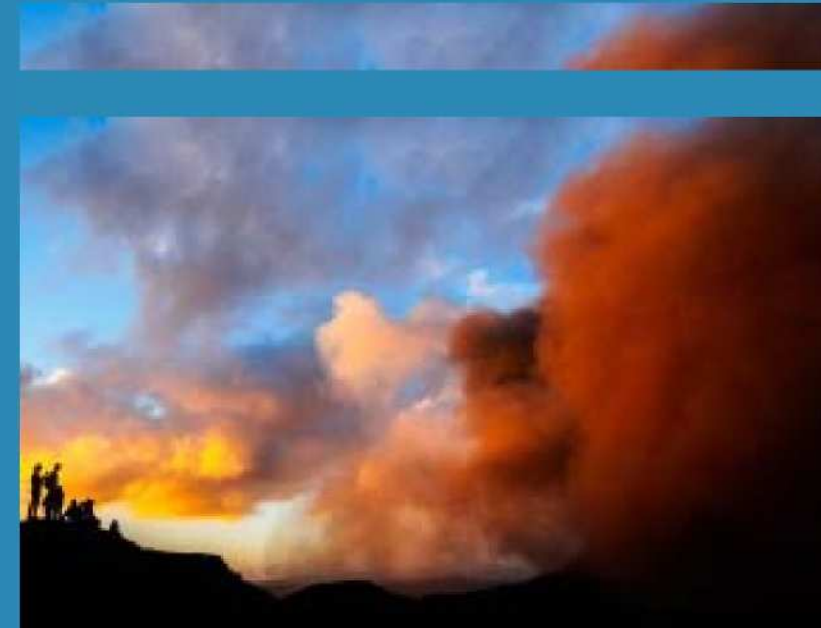
Mount Yasur active volcano

The tax haven of Vanuatu provides excellent offshore banking and banking services to private individuals and corporations. Vanuatu offshore banking centre is very active with numerous banks having received license to provide offshore banking services. Vanuatu has a number of international banks' branches and agents providing services to the public. As a tax haven Vanuatu offshore bank accounts pay no taxes on interests earned.